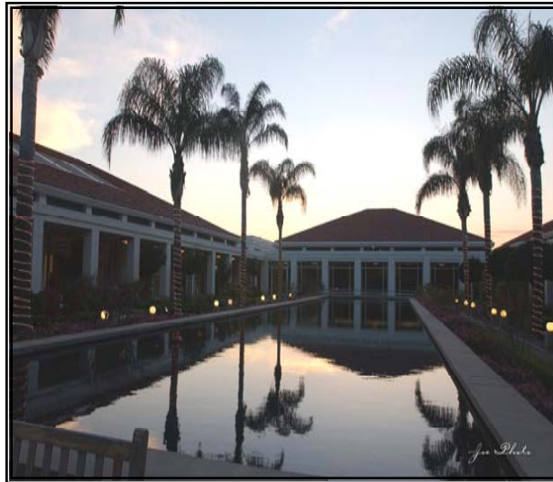
Reflecting Pool at the Richard Nixon Presidential Library and Museum